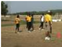
Groin side skips