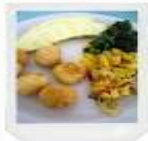
Ackee & salt fish breadfruit & callaloo